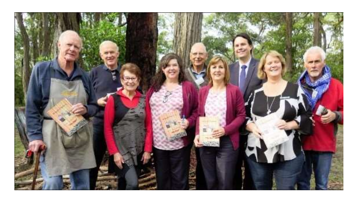
Those that were involved in the creation of the Cookbook

Many men are skilled in the art of cooking. Others, void of culinary knowledge are often thrown into the deep end out of necessity due to unforeseen circumstances.