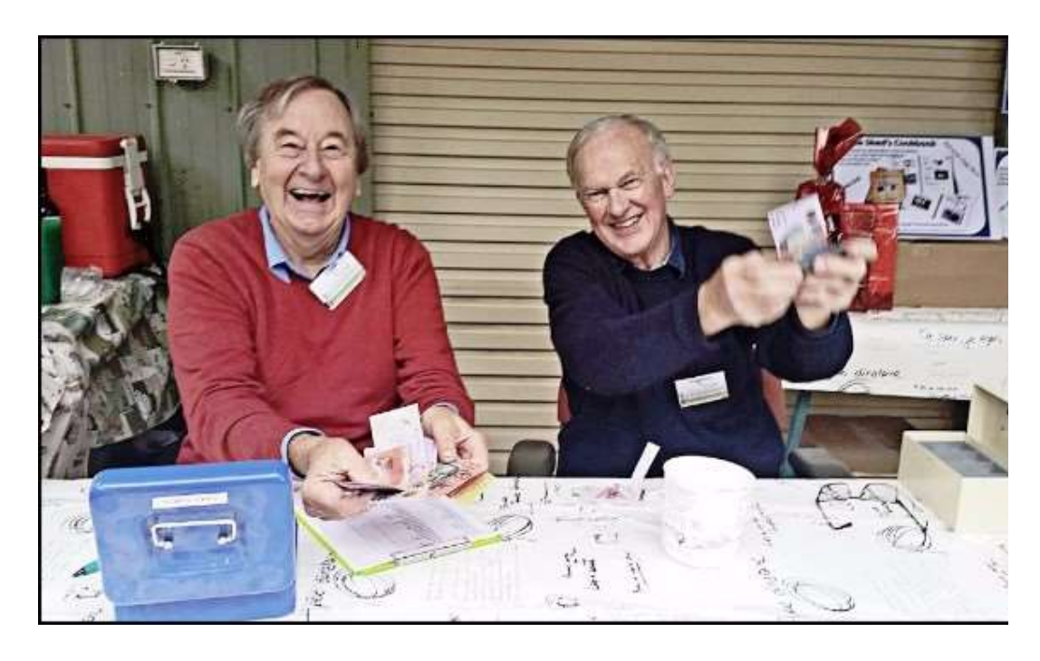
The money bags